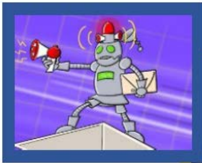
Options' Annual Calendars