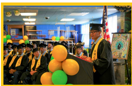
OMCP Graduation at Solano State Prison

Options provides in-prison programs for inmates to address addiction. In Options' Occupational Mentor Certification Program (OMCP), inmates are trained as certified addiction mentors to help other inmates while they also address their own addictions. Currently there are 448 OMCP mentors working at 31 prisons throughout the state. Over the past year, 140 inmates have graduated from the program, passed their California certification exams, and have been assigned to prisons and/or released on parole to continue offering mentoring and counseling help for others addressing addiction. Options also provides a treatment and recovery program in Alameda County's Santa Rita jail for inmates with addictions.