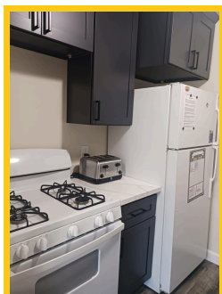
Kitchen Remodel at King Street

In 2024 Options continued to provide Substance Use Disorder treatment at outpatient clinics in Berkeley, Concord, Oakland, and San Leandro, and co-occurring Substance disorder and mental health treatment in Berkeley and Oakland. Over the past year, Options has admitted over 800 clients into its Outpatient Services (up to 9 hours per week) and Intensive Outpatient Services (9 to 19 hours per week)