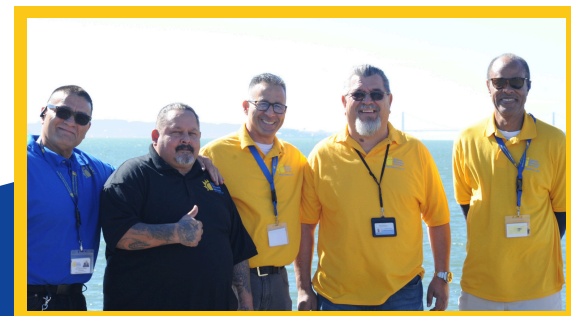
Options' Outreach Team provides community outreach services for up to 300 community residents per year

Set to begin in the next few weeks, Options, with a contract from the City of Berkeley, will be providing mobile community outreach services to community centers, city residents, and homeless encampments. This innovative program will be providing onsite screening for treatment eligibility and will be bringing services to people in need rather than just referring people to other agencies. The program will be staffed by "Navigators" with lived experiences and trained by Options.